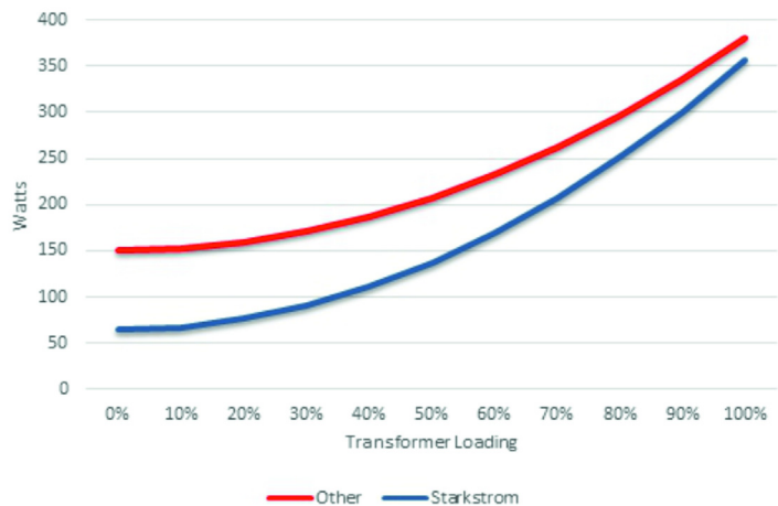
10kVA Transformer: Heat Loss Comparison

Starkstrom transformers can generate energy savings of up to 63% compared to other suppliers of medical isolated transformers (see 10KVA comparison graph). This has the benefits of reducing direct energy costs and reducing the cost of removing the excess heat.