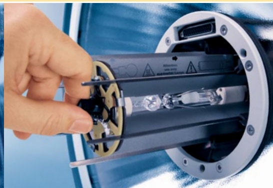
substiLite – the light source that is replaced within seconds

Everything is at your fingertips. sensoGrip.