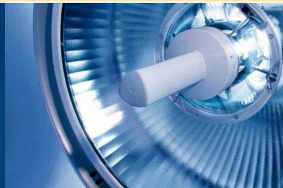
sensoGrip – the multifunction tool