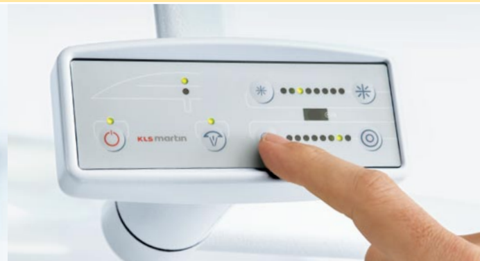
surgiCam operation via the operating light’s “double-function”, integrated control panel