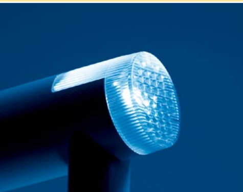
backLite – for endoscopic interventions

Nothing could be more important than safety. marLux® gives you just that. With a well-thought-out set of features that ensures optimal lighting conditions at any time. Through flexible adjustment of the illumination level or the size of the light field, for example. Through easy lamp replacement with a single movement of the hand – no tools required. Through the additional halogen lamp that guarantees immediate as well as reserve light. And last but not least, the LED light that comes on automatically to provide just the right background lighting during endoscopic interventions.