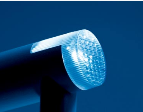
backLite – for endoscopic interventions

Nothing could be more important than safety. marLux® gives you just that. With a well-thought-out set of features that ensures optimal lighting conditions at any time. Through flexible adjustment of the illumination level or the size of the light field, for example. Through easy lamp replacement with a single movement of the hand – no tools required. Through the additional halogen lamp that guarantees immediate as well as reserve light. And last but not least, the LED light that comes on automatically to provide just the right background lighting during endoscopic interventions.