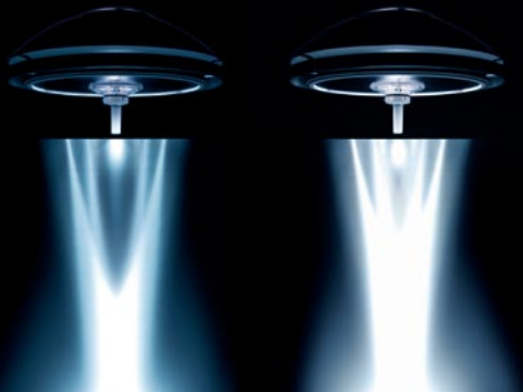
centriXbeam® for deep cavity illumination: mid-reflector off (left) and on (right). Significantly more light when the central reflector is on.