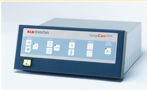
The separate surgiCam control unit

Nowadays, it is even no longer necessary for the surgeon to be “on-site” for giving the right directions. But wherever he or she is, a clear view of things is indispensable. With the focus on the surgical site, of course. This is exactly what KLS Martin’s digital camera system has been designed for: teleconsulting live, via camera. At the same time, the recorded interventions can be used as illustration material for training purposes as well as for comprehensive patient documentation.