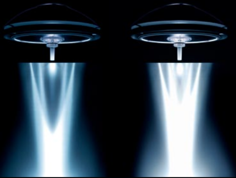
centriXbeam® for deep cavity illumination: mid-reflector off (left) and on (right). Significantly more light when the central reflector is on.